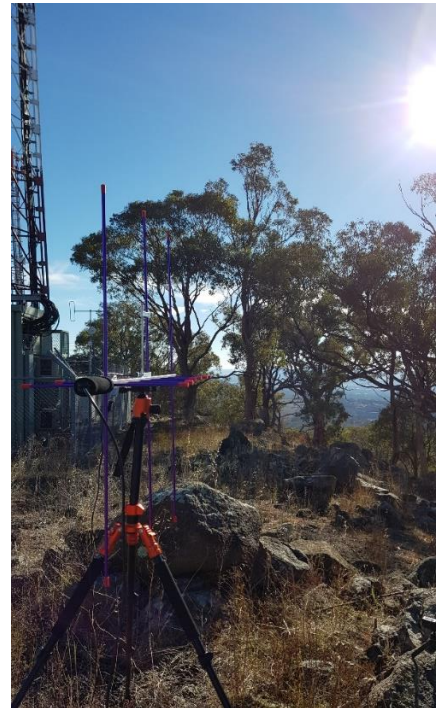
Bill's antenna setup for 70cm CW

Although conditions on HF weren't too good, the sun was shining, and everyone was wearing a smile. With easy access and great views over Canberra, Mt Ainslie is popular with tourists and locals alike. We had quite a few onlookers and enquiries about what we were doing, so it was also an opportunity to explain amateur radio to the public.